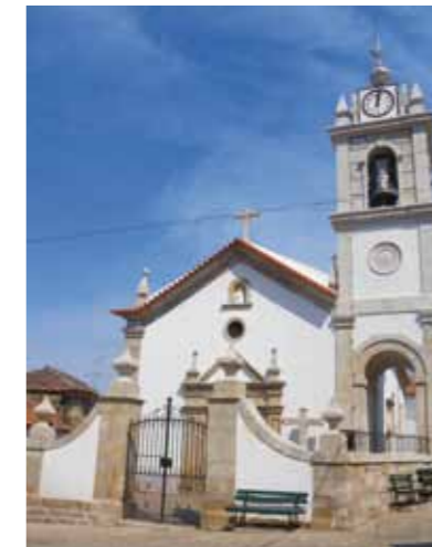
TÕES Parish Church Chapel of Nossa Senhora da Guia Quinta da Lama Redonda 41° 5'49.08"N; 7°43'2.01"W